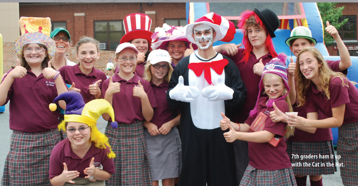
7th graders ham it up with the Cat in the Hat.